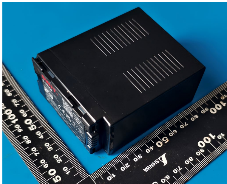
Fig. 2 – Back view of Power Bank 表2-电池反面视图