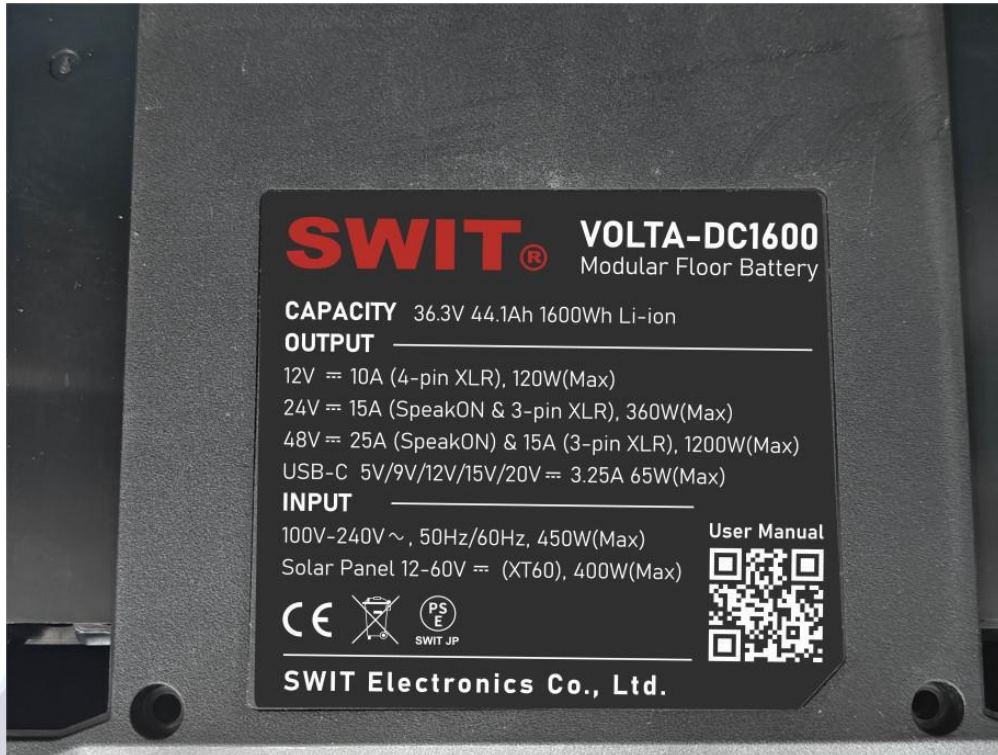
Picture 5. Label view