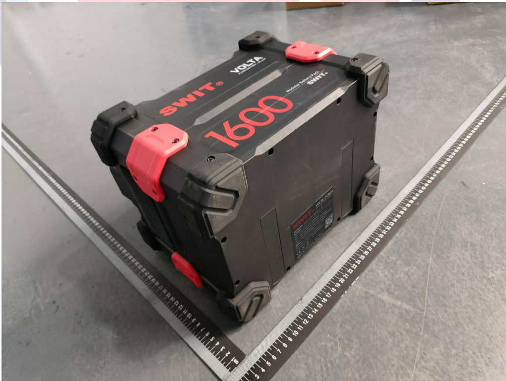
Picture 2. Back view of battery 图片 2. 电池组后视图