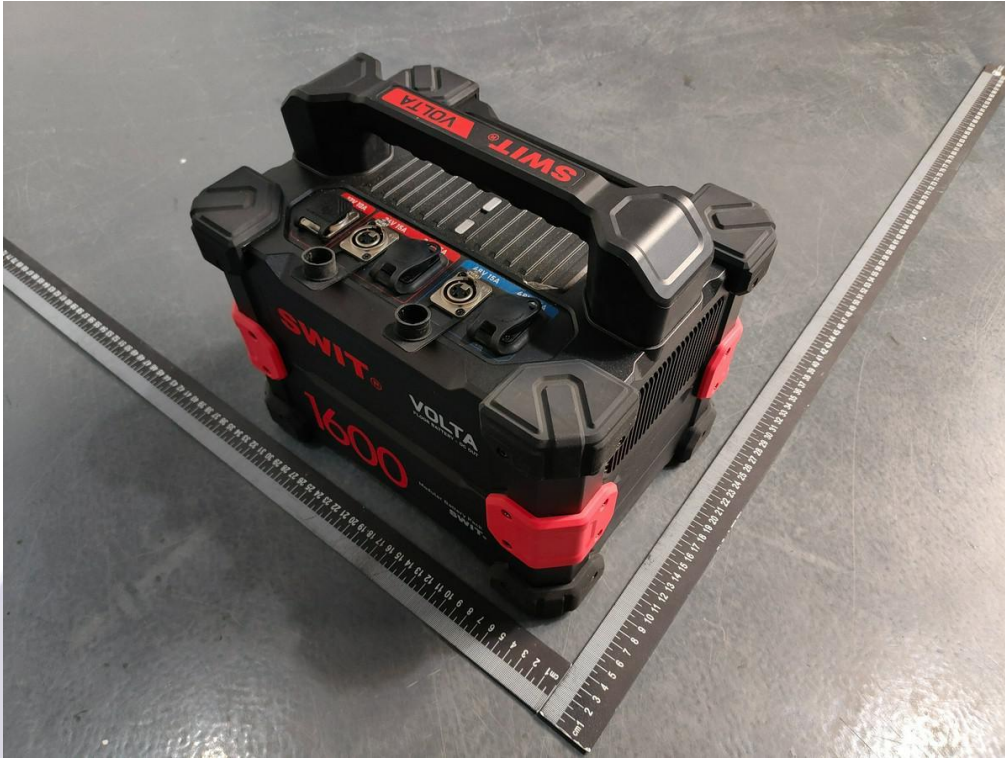
Picture 1. Front view of battery 图片 1. 电池组前视图