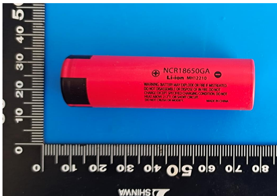
Fig. 4 – Back view of Cell 表4 – 电芯反面视图